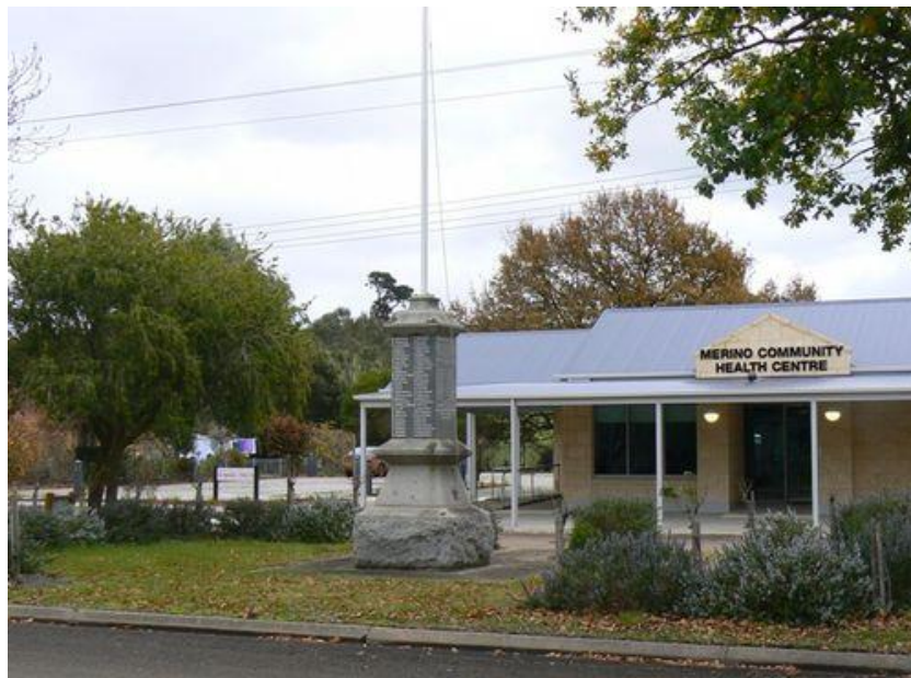
Merino War Memorial