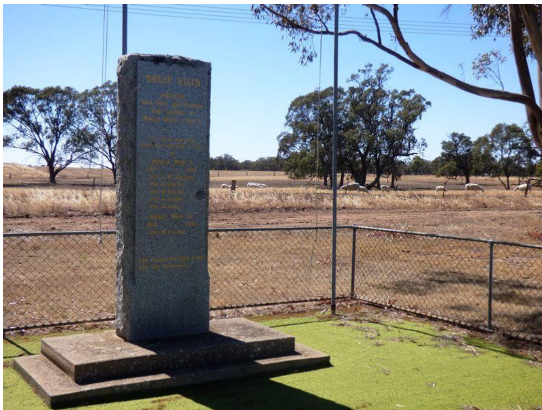
Sheep Hills War Memorial